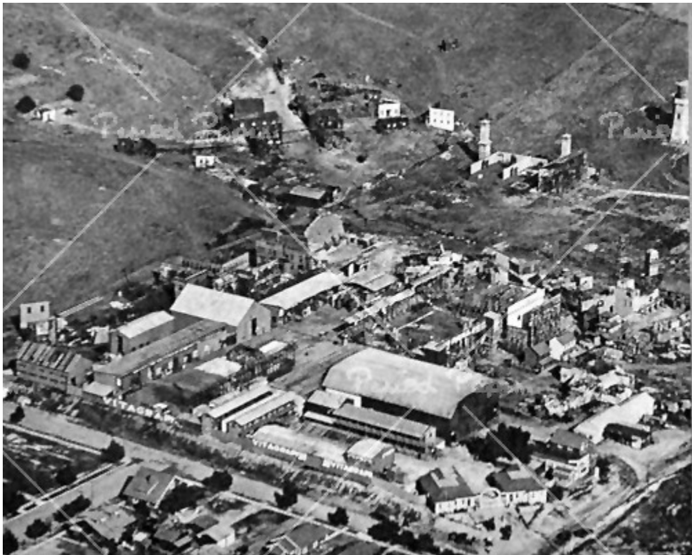
Vitagraph Studios, 1918

tually, the studio was sold at great profit to Warner Brothers in 1927 and the site became their East Hollywood annex. Parts of “The Jazz Singer” were filmed there that same year. In 1948, the property was bought by the American Broadcasting Company, and it soon became its national headquarters, ABC Television Center. After ABC was bought by the Walt Disney Company in 1996, the studio was renamed “The Prospect Studios.” Thus, the studio counts as one of the longest continuously operating sites in cinema history. (Source: “Los Feliz and the Silent Film Industry” published by the Los Feliz Improvement Association, 2014).