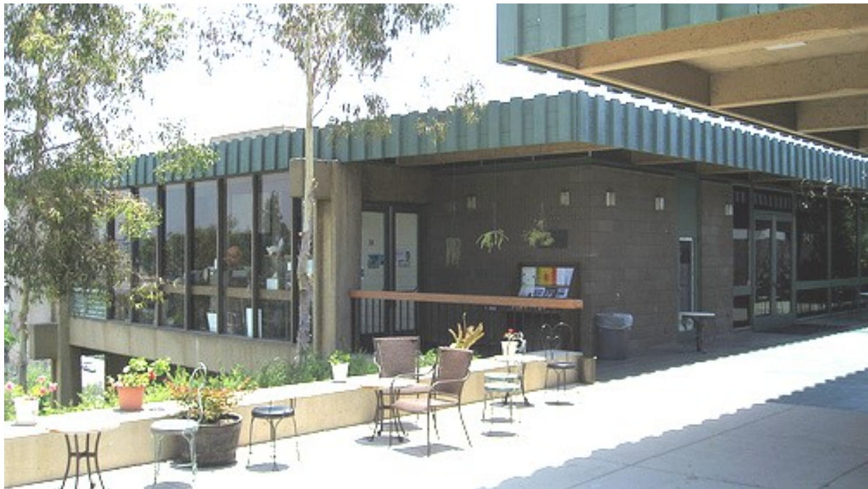
Junior Art Center

As the premier exhibition facility for the City of Los Angeles Department of Cultural Affairs since it opened in 1972, the Los Angeles Municipal Art Gallery enriches our community