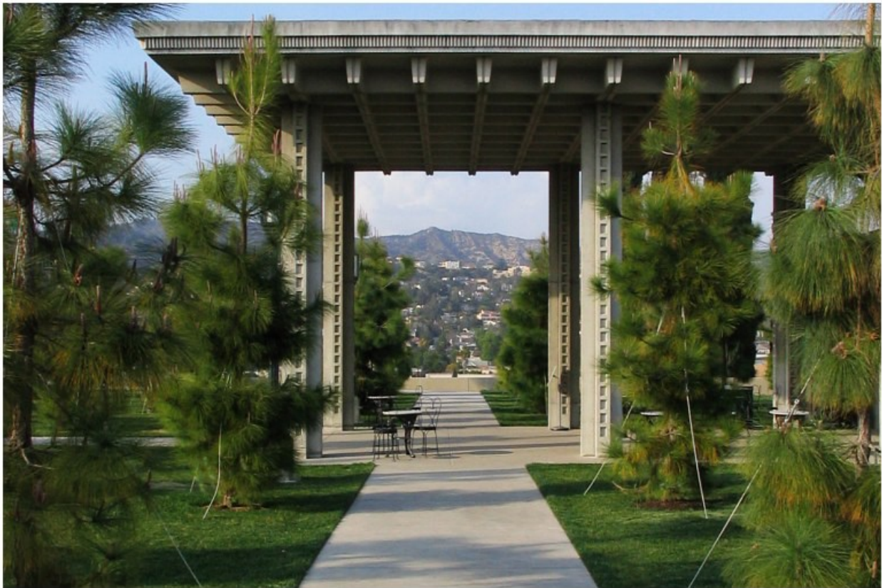
Municipal Art Gallery

(Donald Seligman; from Barnsdall Art Park Foundation Business Plan, 2010)