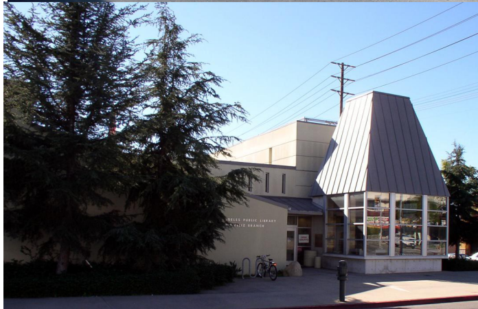
Los Feliz Branch of the Los Angeles Public Library.

Lot FR 1 and FR 2. 12,825 sq/ft. 90027. C4-1D. Map 150B197 and 150B201. Mt. Hollywood Grand View Tract.