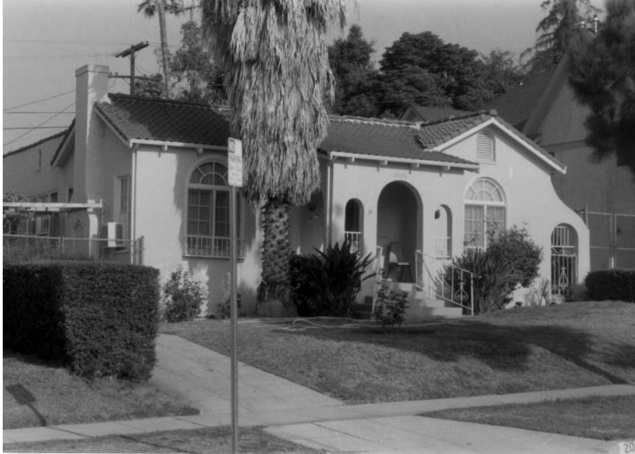
Before alteration above; After alteration below.

1s Spanish 5589-019-010 1923 [5.14, 90205] Altered with Greek columns.