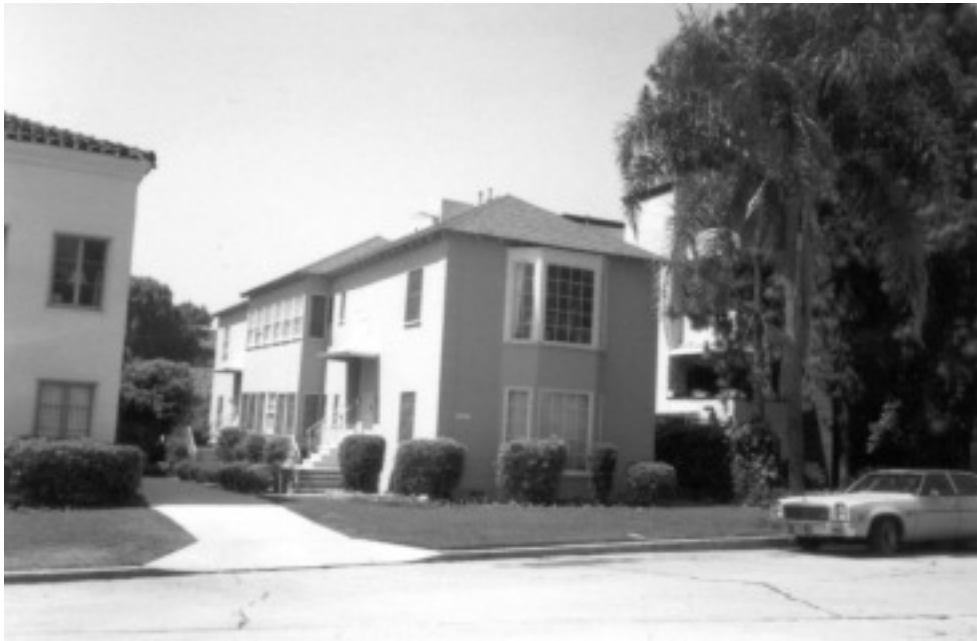
Rowena Manor Apartment.

2s Colonial influence 4-apartment 5433-001-026 1938 [6.22]