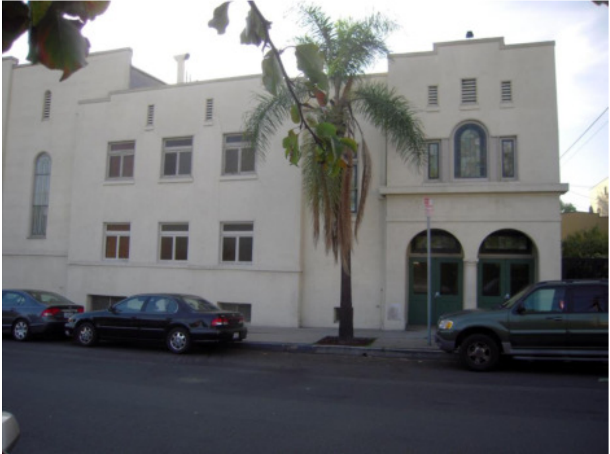
Side of main building of Mt. Hollywood Congregational Church

Single Residence: ?-bedrooms, ?-baths, 6178 sq/ft.